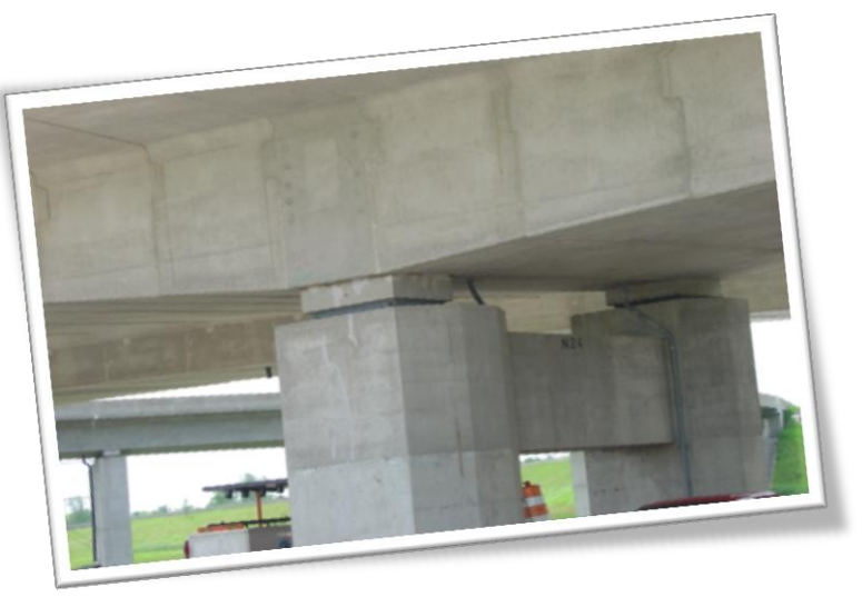
Typical Pier Bearing